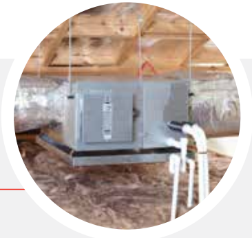
Indoor Fan Coil Unit installed within a roof space