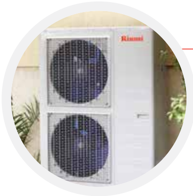
Outdoor Condensing Unit

A typical installation includes a system of insulated duct work distributing conditioned air throughout the entire home.